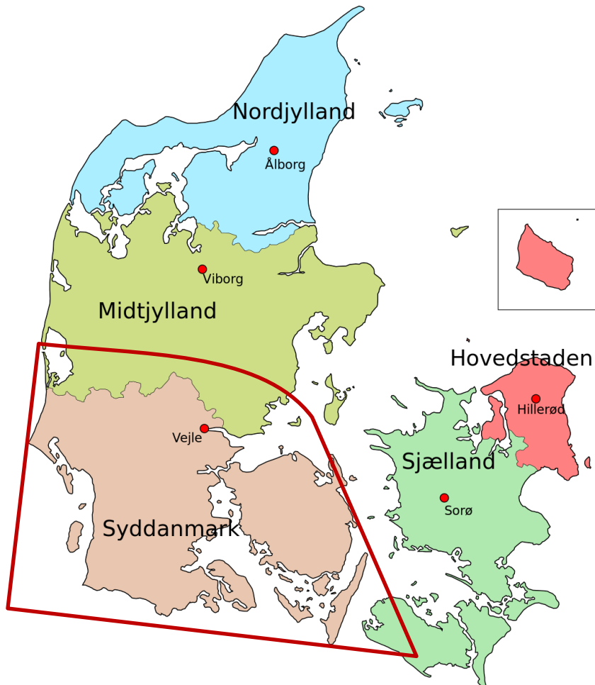
Figure 1: The supply base is mainly region “Syddanmark” and “Midtjylland”

SYD is mainly harvesting biomass from region “Syddanmark” and “Midtjylland”.