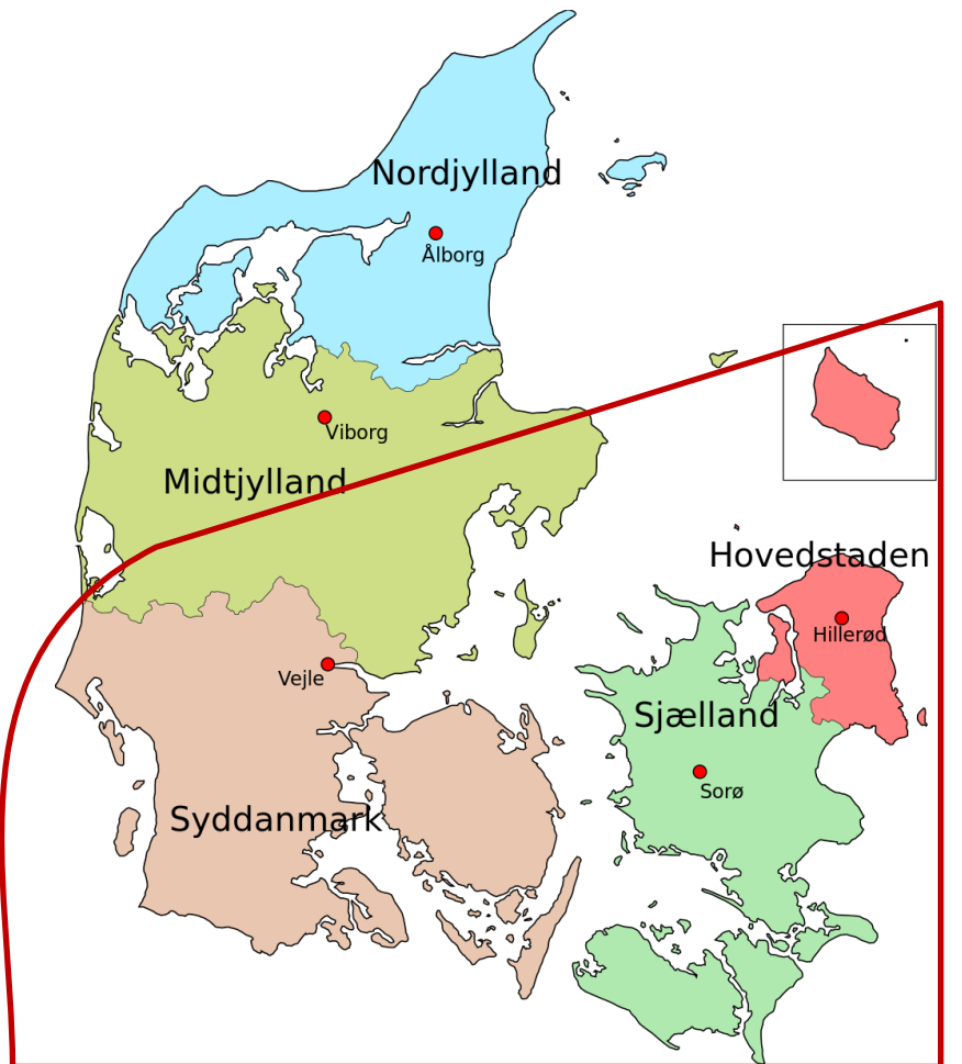
Figure 1: The supply base is mainly from the regions Syddanmark" "Sjælland" and "Hovedstaden".

ØERNE is mainly harvesting biomass in region `Syddanmark, `Sjælland`and `Hovedstaden`