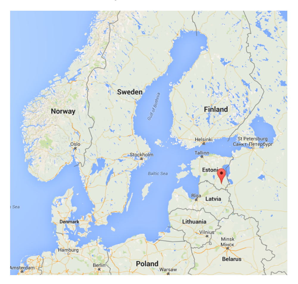
Figure 1. Location of Warmeston OÜ's Järvere plant

WARMESTON OÜ is an Estonian based wood pellet producer which owns three production facilities in Estonia. The current SBR describes the facility located in in the southern part of the country in Järvere village, Võru Parish as indicated in Figure 1.