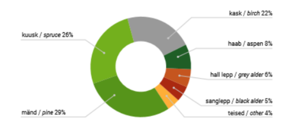
Figure 1 The distribution of growing stock by tree species (Yearbook Forest 2017).

For logging in any type of forest, it is required that a valid forest inventory or forest management plan, along with a felling permit issued by the Environmental Board, is available. All issued felling permits and forest inventory data is available in the public forest registry online database<sup>9</sup>.