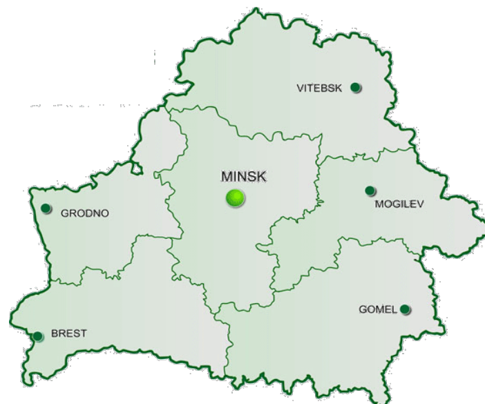
Pic.1. Supply base of JLLC «Dimsania» - Republic of Belarus

JLLC «Dimsania» is a woodworking enterprise located in the Republic of Belarus. The main activity of JLLC «Dimsania» is the production of wood pellets. For the production of pellets, the company only uses sawdust procured from FSC-certified suppliers (sawmills) and Forest management units (leshozes) in the Republic of Belarus. The feedstock delivery to the production location is carried out with the company’s own transport.