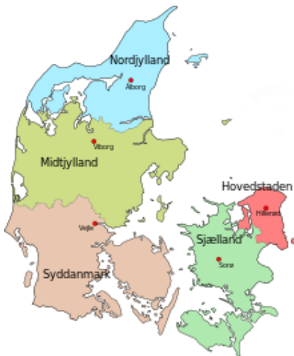
Figure 1 Supply Base

Haderup Skovservice's supply base is Danish forests, windbreaks, scenic areas and urban plantations where the supply base covers all of Denmark, however, mainly North-Jutland.