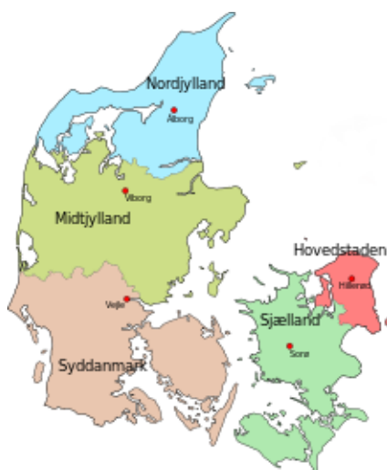
Figure 1 Supply base

Alstrup Skovservice's supply base is Danish forests, windbreaks, nature areas and urban plantations, all over Denmark, mainly in Mid-Jutland.